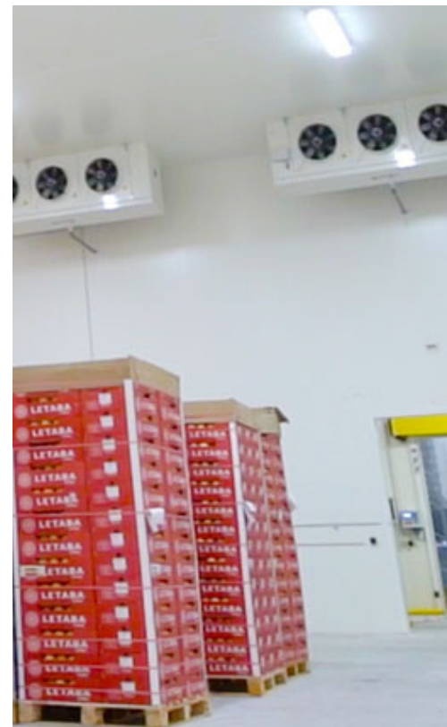
Imported Iceberg lettuce & romaine lettuce