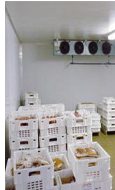
Imported Potato & Tomato