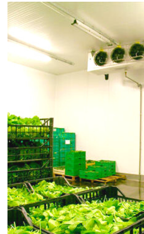
Imported Lollo-bando & Herbs