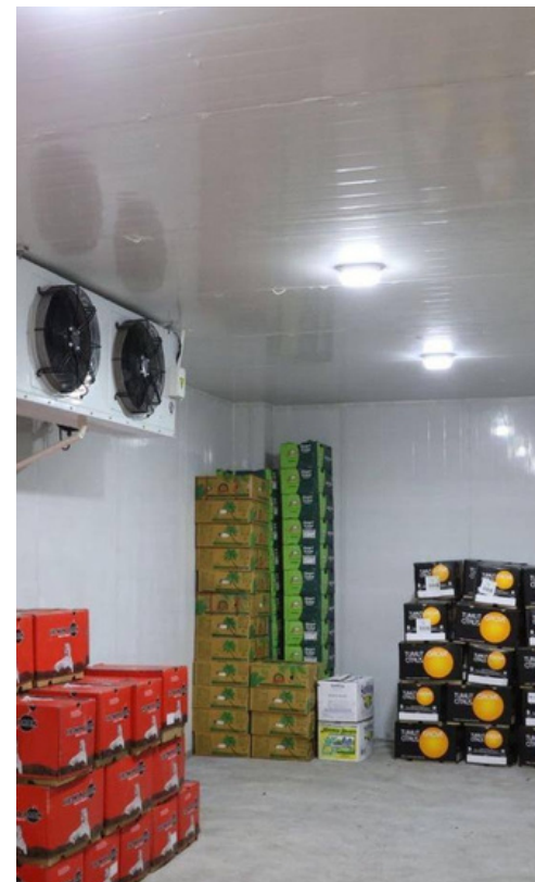
Imported Orange & Pomegranate