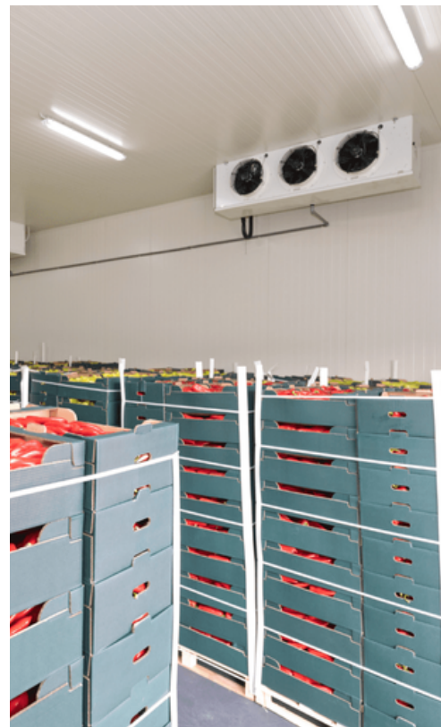
Imported red and yellow bell pepper

Farz Awal is equipped with a modern cold storage facility. The company has Heavy and Medium delivery vehicles to carry and distribute goods to our customers. We are using very hygienic refrigerated vehicles for supplying highly perishable fruits and vegetables. We insure that all handling is done in a suitable and hygienic procedure. We have no delivery charges.